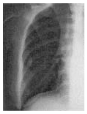
Fig. 1b: Oblique view of the right hemithorax showing an atypical fracture of the right 8<sup>th</sup> rib and radiolucent areas in several other ribs.

A technetium-99m diphosphonate bone scan showed increased radioisotope uptake in the areas identified as abnormal by plain radiography (Fig. 2a, 2b).