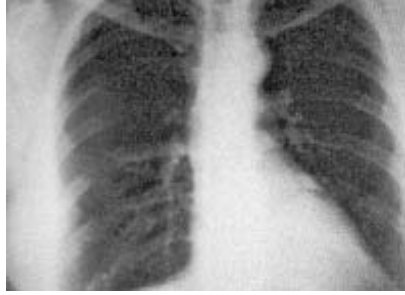
Fig. 1a: Photograph of a PA chest X-ray. There appears to be a lytic lesion in the posterior aspect of the right 8<sup>th</sup> rib. Its margins are widely separated. This does not look like a typical fracture.

This previously well 50-year old premenopausal woman reported severe chest pain after onset of acute cough ($ 2 weeks duration). There was no history of trauma and no acute respiratory infection. Physical examination showed marked bilateral tenderness on the chest wall during respiration. Regional lymphadenopathy and hepatosplenomegaly were not detected. Skeletal survey by plain chest radiography showed, at that time, multiple focal involvement of ribs with bilateral osteolytic lesions and rib fractures (Fig.1a, 1b).