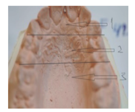
Fig. 4: Median raphe extension in the hard palate in three imaginary subdivisions, after Filho et al (17).

The collected data were tabulated and statistically analysed using SPSS statistical package version 19, for determining the mean, standard deviation (SD) and percentage. Student t -test and Chi-square tests were applied for comparing the studied parameters in both genders (18).