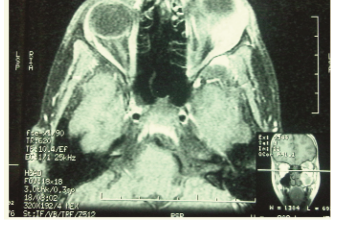
Fig. 2: T1 weighted magnetic resonance imaging shows right proptosis with a poorly defined hyperintense mass.

superior oblique and superior rectus muscles were displaced inferiorly. The left maxillary sinus was completely opacified by a heterogenous mass (Fig. 3). No bony destruction was present.