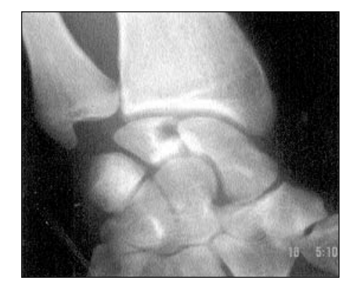
Fig. 1: Plain radiography revealed a cyst of the lunate with cortical defect, but no collapse of the lunate, loss of joint space or other degenerative changes.

A 34-year-old man presented with an insidious and dull aching pain in his left wrist for three years. He denied any prior episode of specific trauma. The painful wrist appeared normal on physical examination, with no swelling, redness or deformity. X-ray (Fig. 1) revealed a cyst of the lunate with a