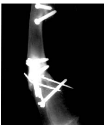
Fig. 1: Congenital pseudarthrosis of the tibia with non-union and angular deformity. Inadequate fixation at the pseudarthrosis site. Fibula was transposed and fused to the tibia.

A ten-year old child was diagnosed at age one year with CPT. Four surgical procedures which included open reduction and plating of the tibia with bone grafting, two separate bone grafting procedures and transposition of the fibula were performed in an attempt to heal the pseudarthrosis. Due to the failure of union, the child was referred to the authors. Examination revealed anterior bowing of the left tibia, a stiff ankle with a valgus deformity and a 9cm leg-length discrepancy (Fig. 1).