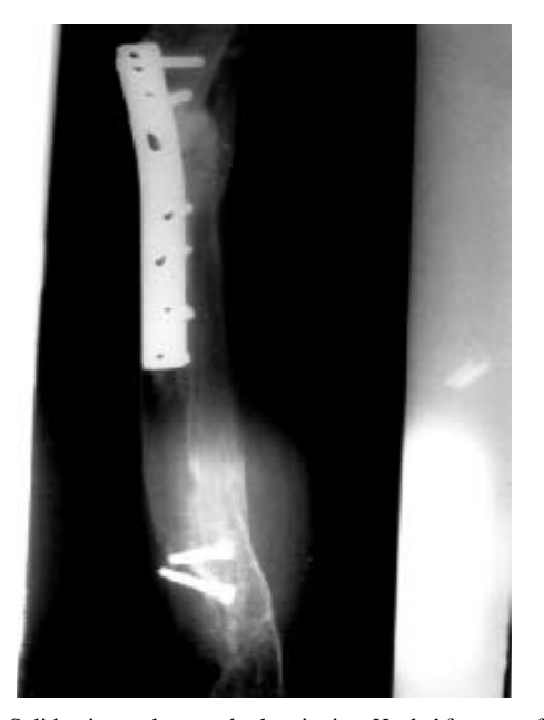
Fig. 4: Solid union at the pseudarthrosis site. Healed fracture of the regenerate bone. Dynanic compression plate in situ .

The child fell and fractured through the regenerate bone which was still protected with a cast. An open reduction and internal fixation was performed. Two years following removal of the frame, the pseudarthrosis site remained fully healed (Fig. 4). There still remains a 4cm leg length discrepancy and limited ankle motions. This child will be followed until skeletal maturity.