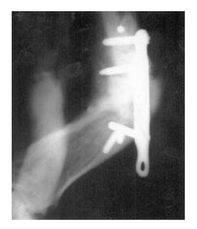
Fig. 5: Congenital pseudarthrosis of the tibia with anterior bowing of the tibia. The plate has protruded through the skin.

the pseudarthrosis, fibula osteotomy, insertion of an intramedullary rod (rush rod) into the tibia along with bone grafting and plate fixation also combined with bone grafting failed to achieve bone union (Fig. 5). Treatment consisted of