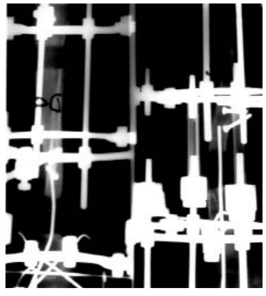
Fig. 2: Antero-posterior and lateral views of the tibia with Ilizarov fixator. Middle segment of the tibia was transported distally over the guide wire.

Under tourniquet control, an anterior longitudinal skin incision was made along the distal third of the left tibia. The periosteum was incised proximal and distal to the pseudoarthrosis and a small periosteal elevator was used to elevate the periosteum both proximally and distally. The pseudarthrosis was then dissected from the surrounding muscles extra-periosteally and a segment of bone and periosteum approximately 4cm long were excised. The medullary canal, which should always be visible at the resection site, was drilled. The gap created by the excision osteotomy was not compressed. A thick K-wire (2mm to 3mm diameter) was passed from the osteotomy site through the sole of the foot and then drilled retrograde into the proximal tibia. A circular ring fixator was then applied. The construct consisted of two full circle rings and a 5/8 ring which were attached to the bone with wires and half-pins. The rings were connected to each other by threaded rods. A small anterior skin incision was then made at the level of the proximal tibial metaphysis and the periosteum was elevated. A Gili saw was passed subperiosteally following which the osteotomy was performed. The proximal osteotomy site was compressed for ten days to allow early callous formation. Distraction over the guide wire was then commenced at a rate of 0.25 mm every six hours (Fig. 2). The docking site was grafted with autogenous