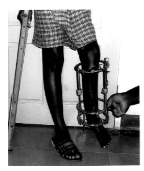
Fig. 3: Patient standing with Ilizarov frame on the left leg. Distraction occurred between the proximal middle rings.

The child fell and fractured through the regenerate bone which was still protected with a cast. An open reduction and internal fixation was performed. Two years following removal of the frame, the pseudarthrosis site remained fully healed (Fig. 4). There still remains a 4cm leg length discrepancy and limited ankle motions. This child will be followed until skeletal maturity.