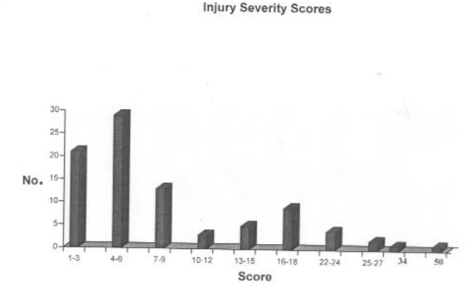
Fig. 2: Injury severity scores of admitted head-injured patients.

# 8) but only nine of these were admitted to the Intensive Care Unit. Most patients (68%) had minor head injuries (GCS 13–15) while 13% had moderate head injuries (GCS 9–12; Fig. 3).